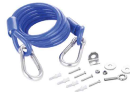
Restraining Cable Kit