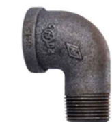
90° Street Elbow