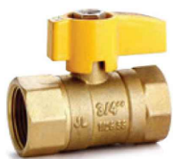
Full Port Valve